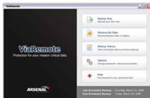
ViaRemote for PCs Main User Interface

Whether your end users work from home, on site or on the road, you need a desktop and laptop backup and recovery solution you can trust. You need ViaRemote for PCs.